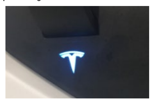
Low Power Charging Indication