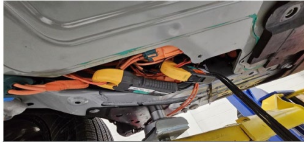
eAC/eCH & OBC/DCDC/DCAC– 200A