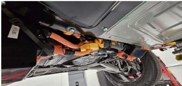
Front/Rear Drive Units – 500A