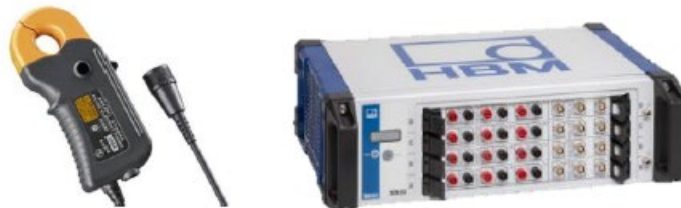
Above: Hioki CT684X-05 current clamp and HBM Gen4TB power analyzer

AC Level 2 240 V/ 48 A (11.5 kW) charger was used for charging.